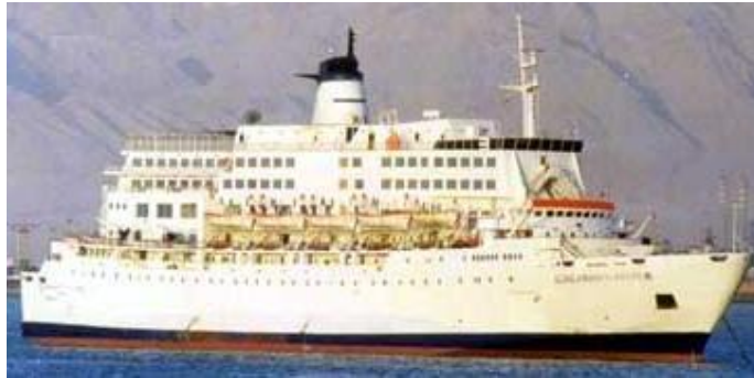
AL SALAME BOCCACCIO 98

other officials are on long term vacations outside Egypt but it is unclear if they have been convicted of anything at the appeal. The master of the SAINT CATHERINE 's conviction was upheld at the appeal. The three sisters of the AL SALAME BOCCACCIO 98 were to have been scrapped in 2010 but went to the breakers very shortly after the sinking. Another sister was burnt out some years before and was scrapped.