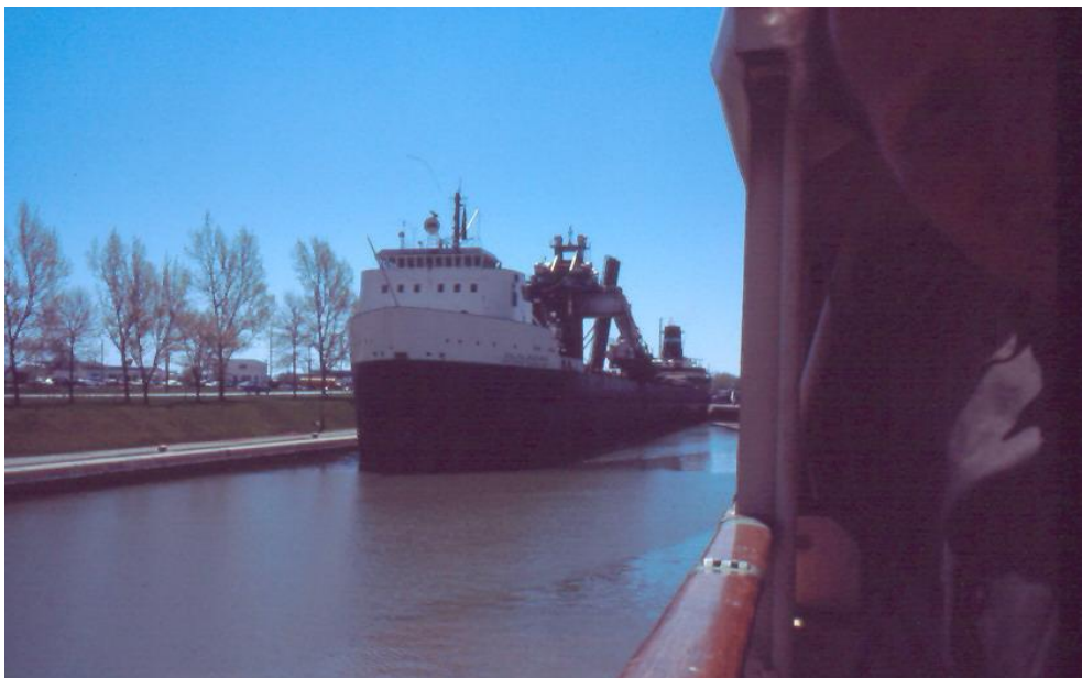
The Great Lakes vessel RALPH MISNER leaving a lock in the Welland Canal