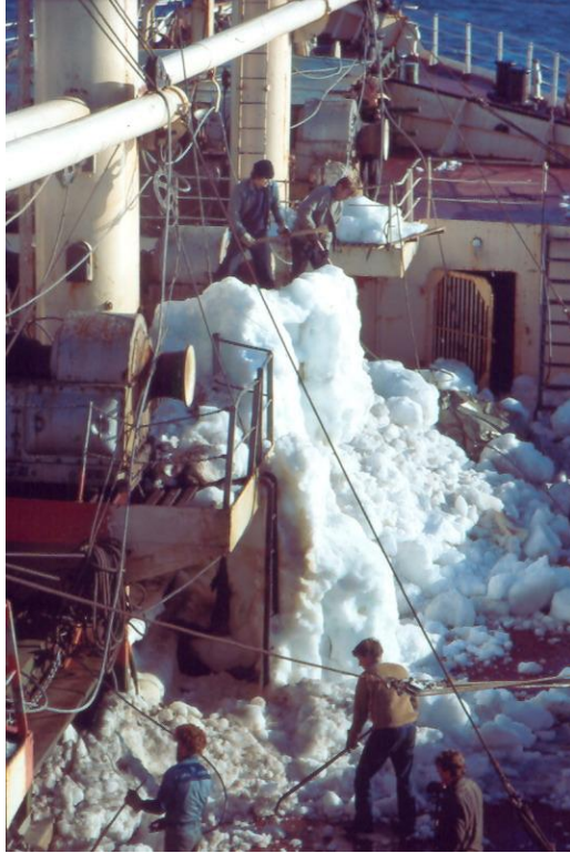
Freezing spray being removed from the fore deck of the MARGAERT BOWATER in Philadelphia in the 1960s. Under the man with the pick axe is the spare anchor. It took four days to clear the fore deck.