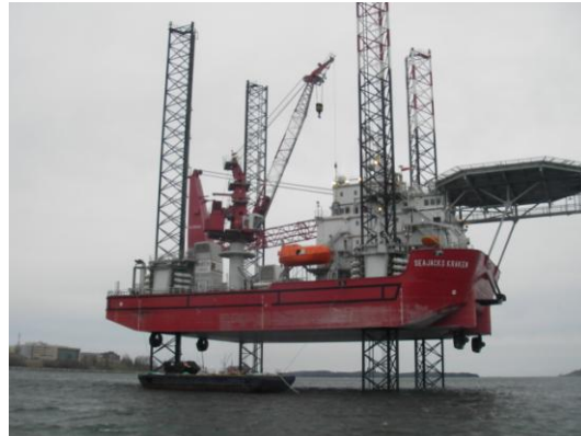
Lift boat SEAJACKS KRAKEN preparing for work in Halifax at the VENTURE platform