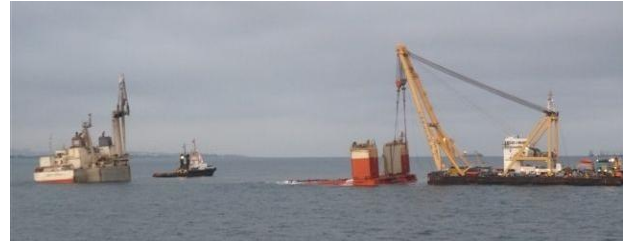
MIGHTY SERVANT being re-floated