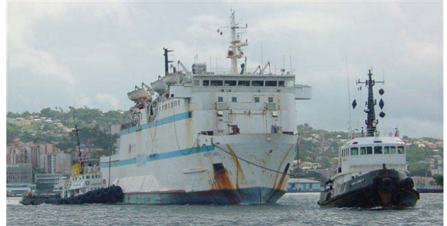
What is the meaning of the signal the tug showing?