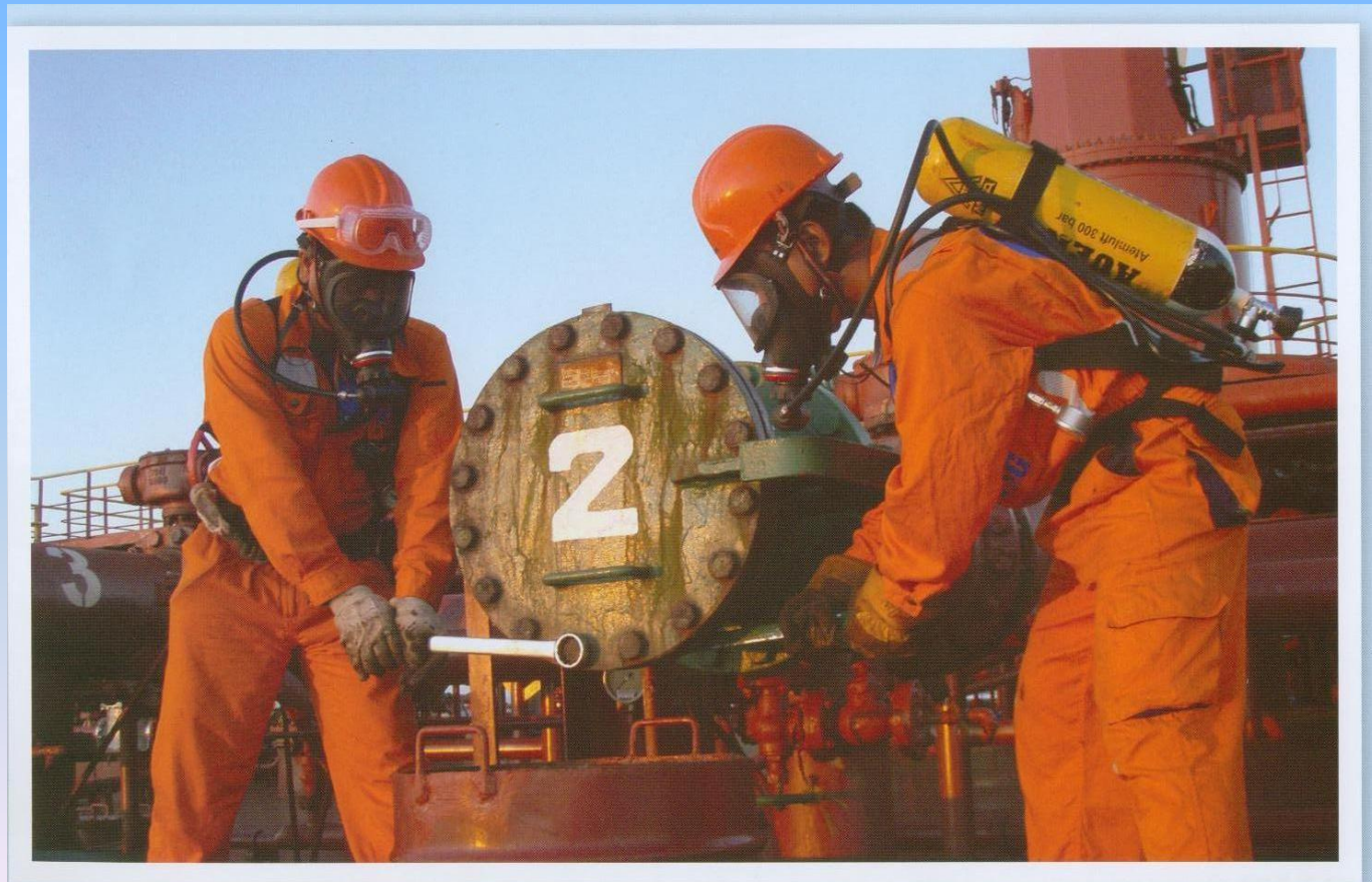
PPE (personal protection equipment) was required when connecting this base on the