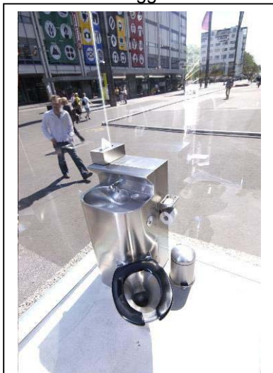
Looking out from the thunder box, no Kent clear view screen or windshield wipers

The moral of these stories is to make sure people reregister their EPIRBs if they purchase a craft with one or have themselves unregistered as the owner if they sell an EPIRB.