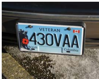
BC's Veteran's car license plates now available.

General. It is hoped that participants in this event will take advantage of the favourable hotel rates provided by Harbour Towers Hotel to remain in Victoria for the