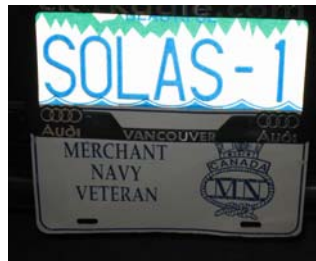
Alan Shard's personal plate, at 20 years of age it must be due a stiff quadrennial survey despite its well maintained appearance.

weekend following the Conference, when the city will be hosting an international "Tallships Event" in the Inner Harbour, located close to the Hotel.