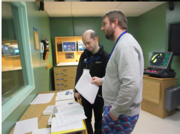
SAR (Search and Rescue):