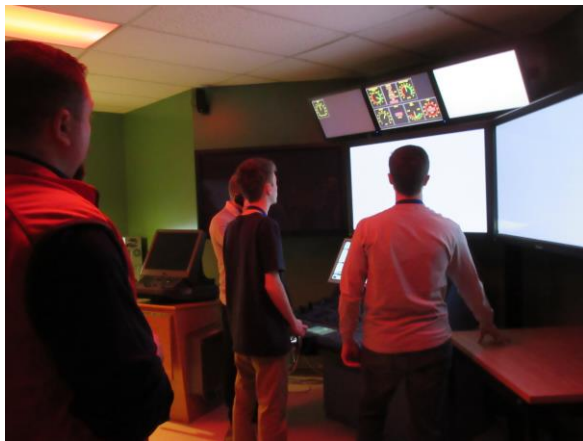
Stability / Ballast and Cargo Work: