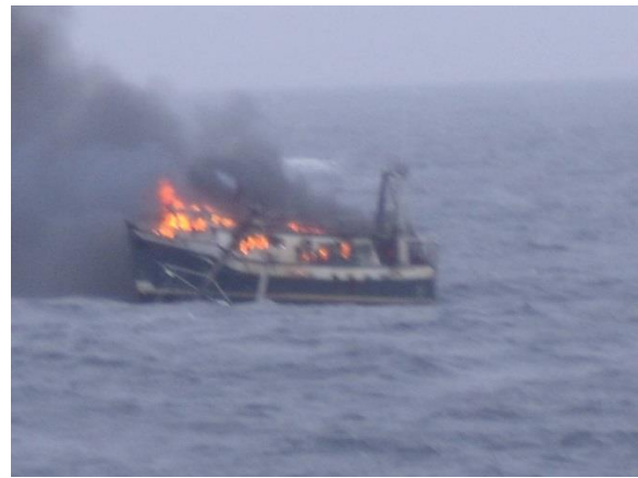
Marine Clipper II approx. 50 Minutes after mayday call received