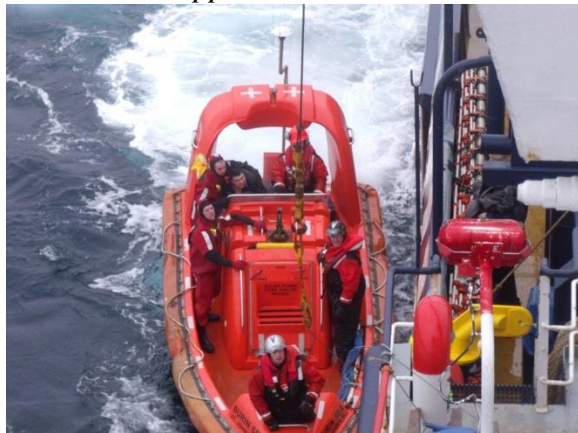
Port FRC returning to the Stbd side of the Burin Sea with first three persons from the Marine Clipper II

The Burin Sea was instructed by the Coast Guard to return to port. Other vessels would recover the life raft, EPIRB and attend to the Marine Clipper II.